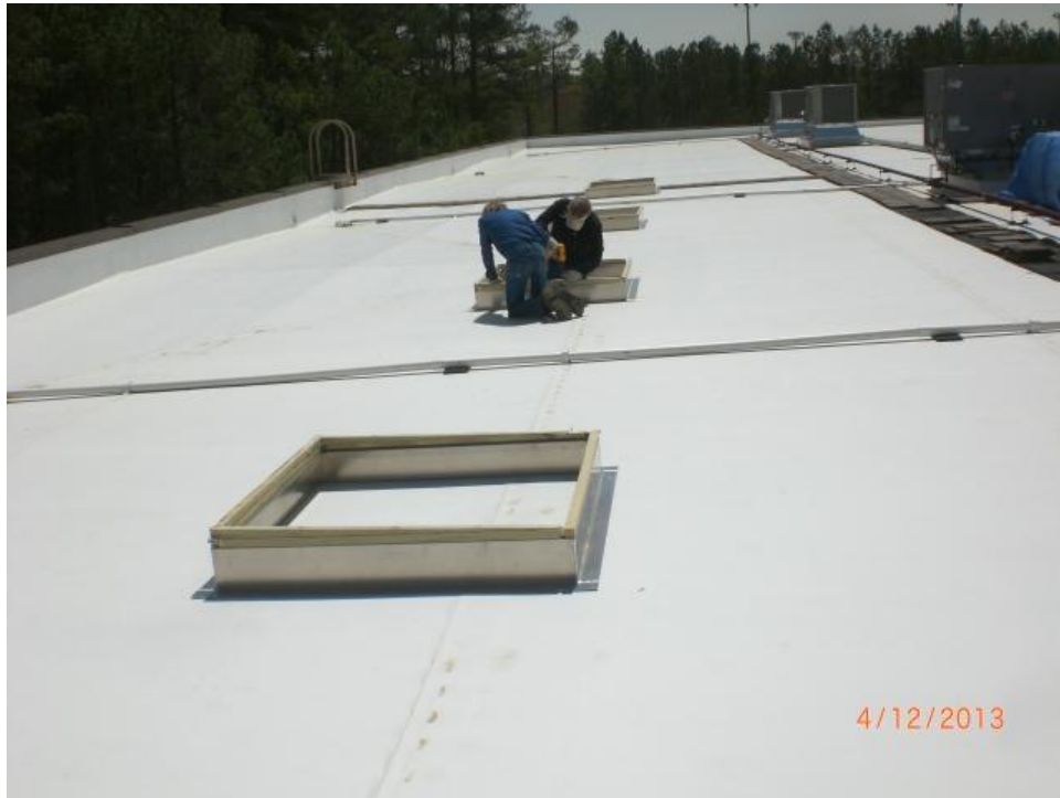
The skylight components were laid into position.