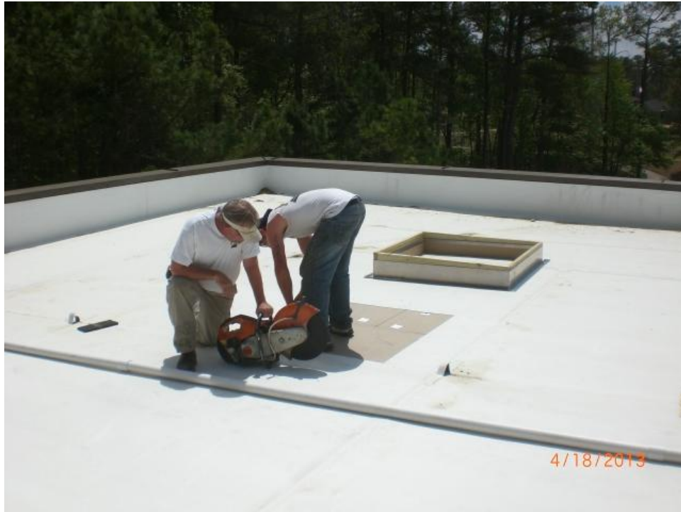
The location for each skylight was marked. The roof, insulation, and decking was then removed and disposed of off site.