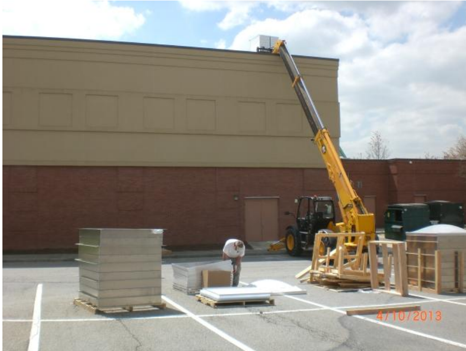
The skylight components and additional supplies were lifted to the roof.