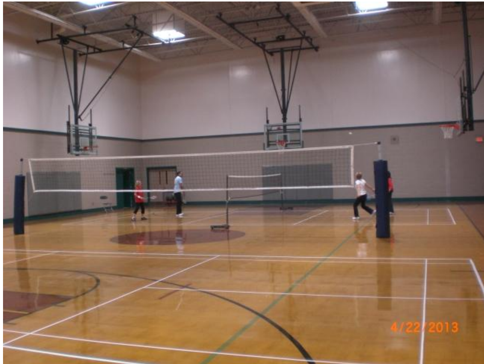
Racquet sports and child care play activities underway in the gymnasium without lights.