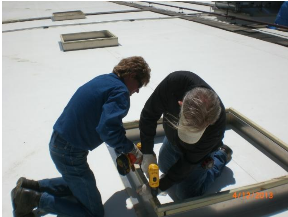
Each curb required custom modification to accommodate the slope in the deck.