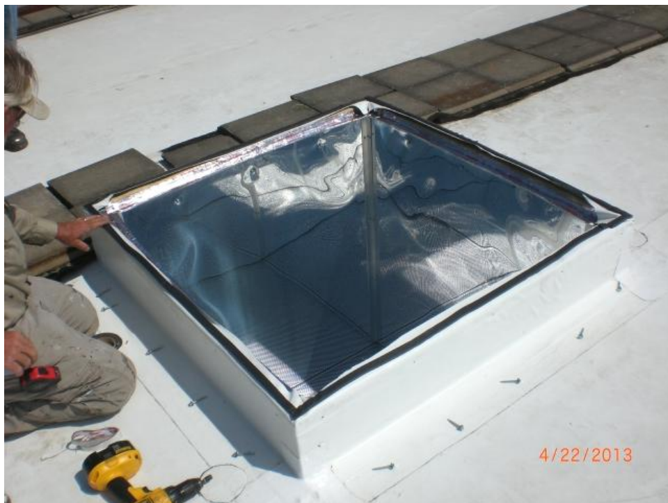
The tops of the light tubes were sealed with light blocking aluminum tape, and the tops of the curbs were covered with foam gasket material.