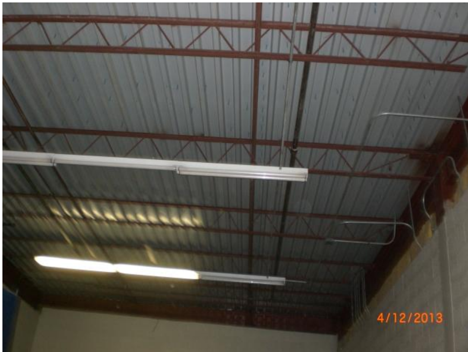
Prior to installation the underside of the deck was inspected for obstructions.