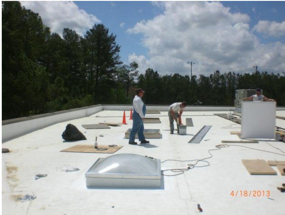
Finally, the skylight domes and frames were installed and mechanically fastened into position.