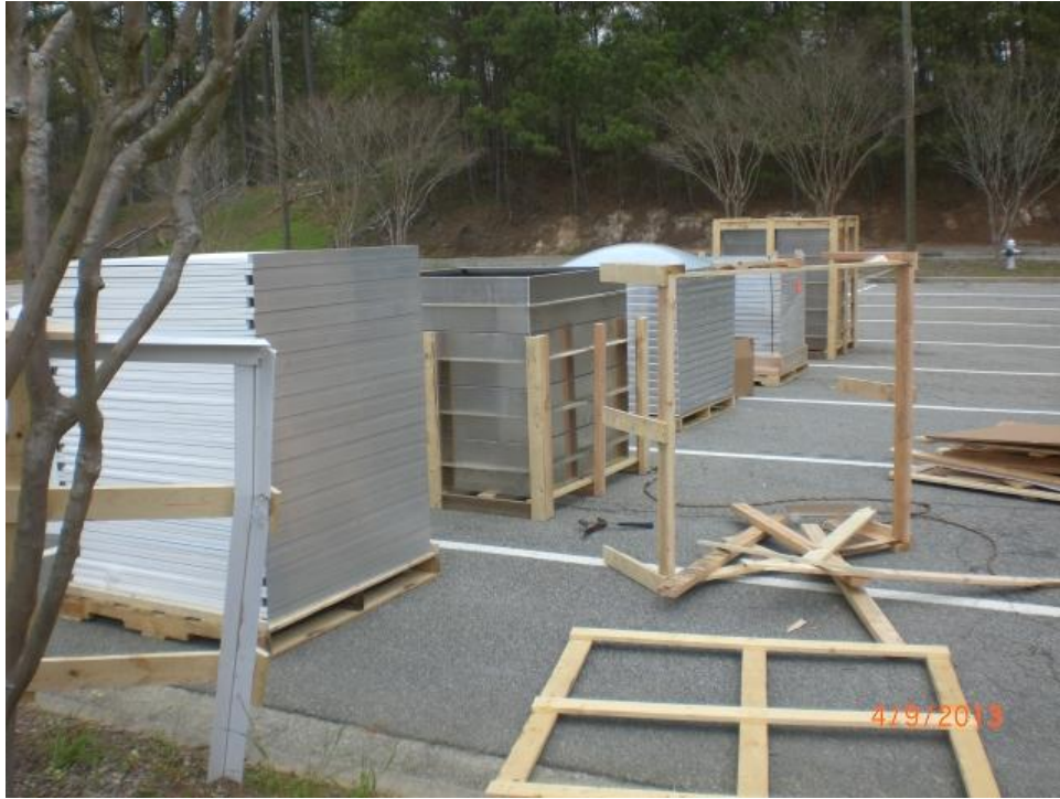
The skylights were delivered to the East Roswell Recreation Center. Pride Roofing began work the week of April 8, 2013.