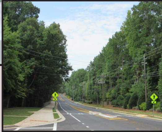
Examples of similar projects on Eves Road.